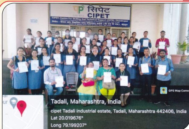
Industrial training of M.Sc. Physics student at CIPET, Chandrapur