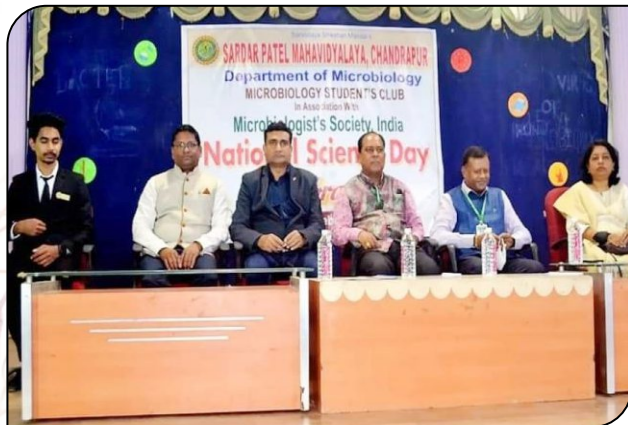
Department of Microbiology & BioTechnology Celebrate National Science Day on 28th Feb. 2022 and organized various competition on the occasion of "Nation Science Day"