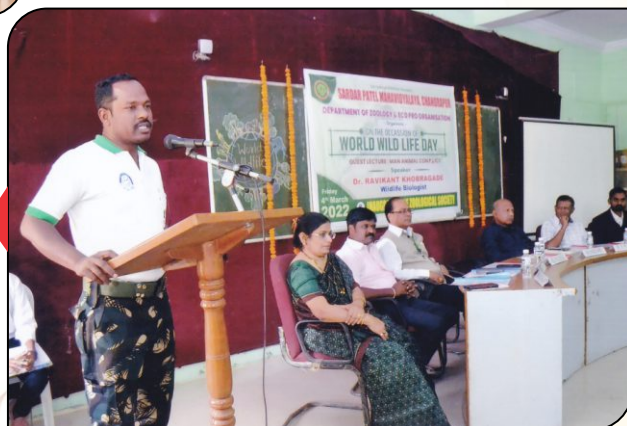
Department of Zoology organized guest lecture on Man And Wildlife Conflict on the occasion of World Wildlife Day