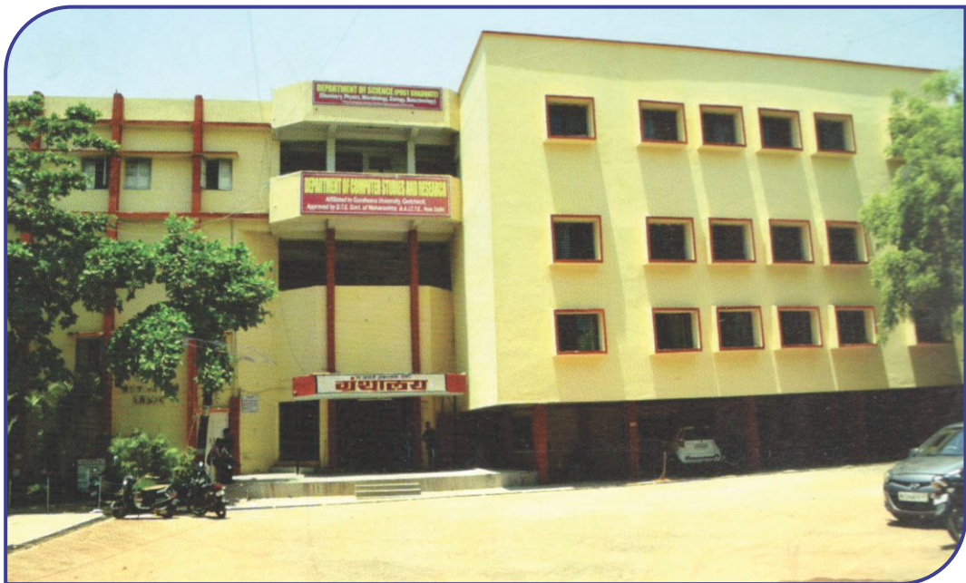
Department of Computer Studies & Research