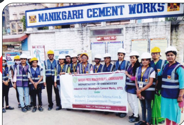
Post Graduate Department of Chemistry M.Sc. Student Industrial visit to Manikgarh Cement at Gadchandur